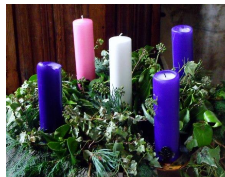
Advent Wreath, St Mary's, West Chiltonington

Option 2: Sing, recite or listen to O Come, O Come, Emmanuel .